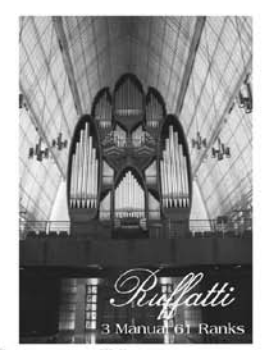
Fratelli Ruffatti Pipe Organs Padua, Italy